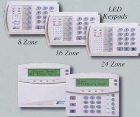
Custom LCD Keypad with removable door.