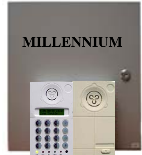
Millennium Control Panel, Keypad & Doorphone.

Millennium(S) is full featured security system with options to arm it in Away Mode, Home Mode, Night Mode or Vacation Mode. Upon detection of any alarm condition, Millennium(S) will automatically activate a dial out sequence to page you, call you or the central monitoring station. User will be notified with specific alarm message over the phone and are able to access the situation immediately without any delay.