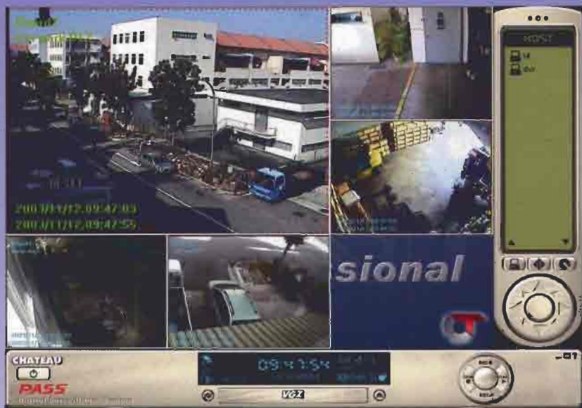
Chateau XP with 5 cameras

Chateau A Surveillance Security System that harness the power of Computer-based video Recording, to bring to the market a reliable and affordable alternative to traditional Closed Circuit TV/VCR based security. For sites with existing CCTV cameras, this system can seamlessly tie-in to these cameras without requiring any modifications. Chateau DVR uses computer based hard drives to digitally record and store images, instead of standard videotapes which have short recording time, quickly wear out. The digital stored method preserves the image quality as it was recorded and can have a storage capacity that is measured in weeks.