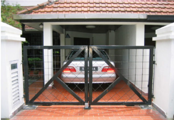
A typical swing gate installation

Established since 1980, Sin Chew Alarm is one of the leading suppliers/installers of automatic swing and sliding gates. Our systems design can be tailored to meet every need you may have, either using your existing gate or even provide you with a new one.